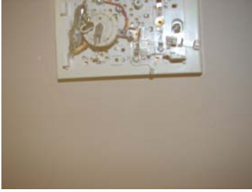
Missing Cover to Thermostat