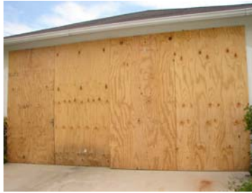
Boarded Garage Door