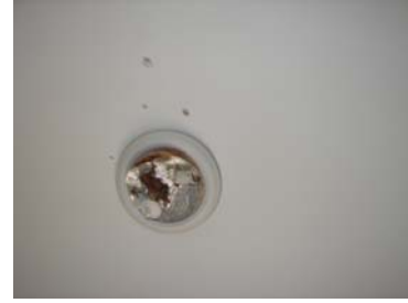
Missing Smoke Detector