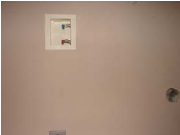
Washer and Dryer Hookups