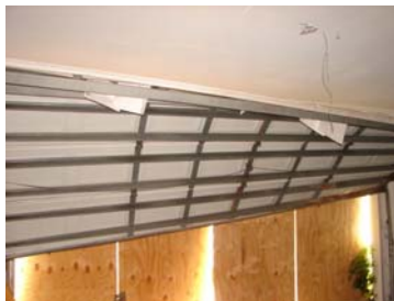
Interior View of Damaged Garage Door